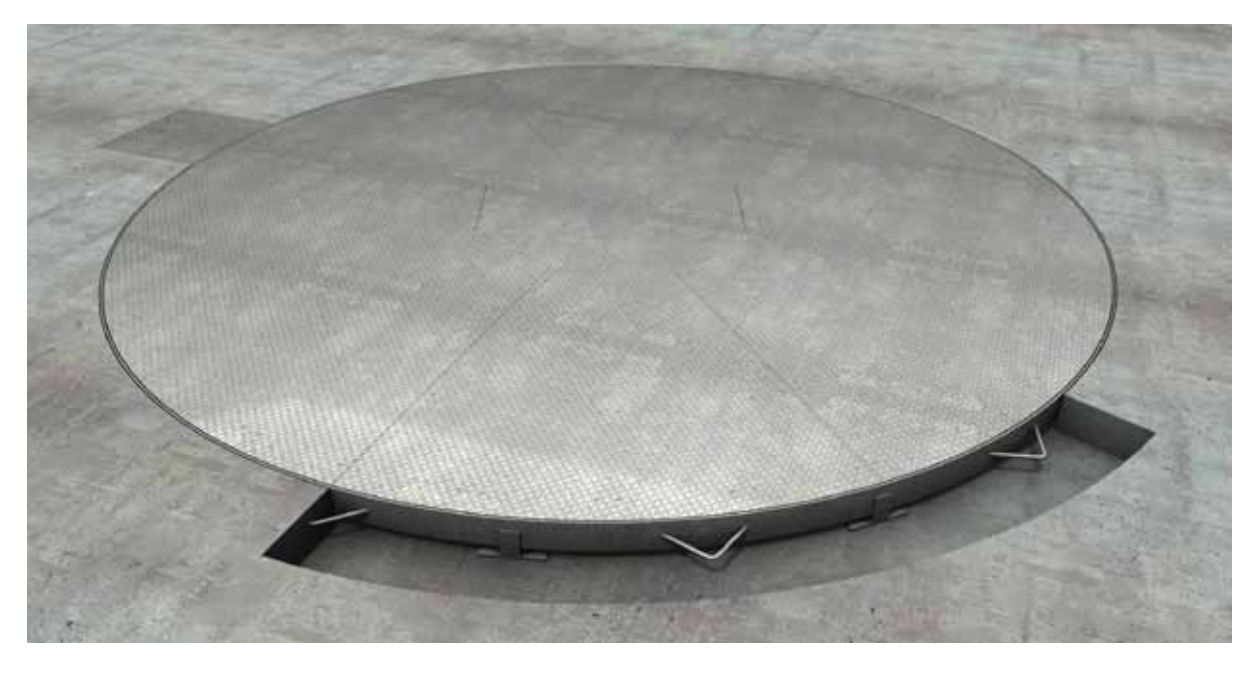
© Copyright Spacepark Global Pty Ltd. Please note that by using this drawing in any format, you accept that Spacepark owns the copyright. You are licensed to use this drawing for any Spacepark turntable on which Spacepark are tendering, and you shall not knowingly allow others to copy this drawing. Obtain appropriate licences from Spacepark if you (or anyone employed or engaged by you) intend to use the intellectual property rights of Spacepark in performing your obligations under any contract. Spacepark reserves the right to amend specifications without notice for product improvement.