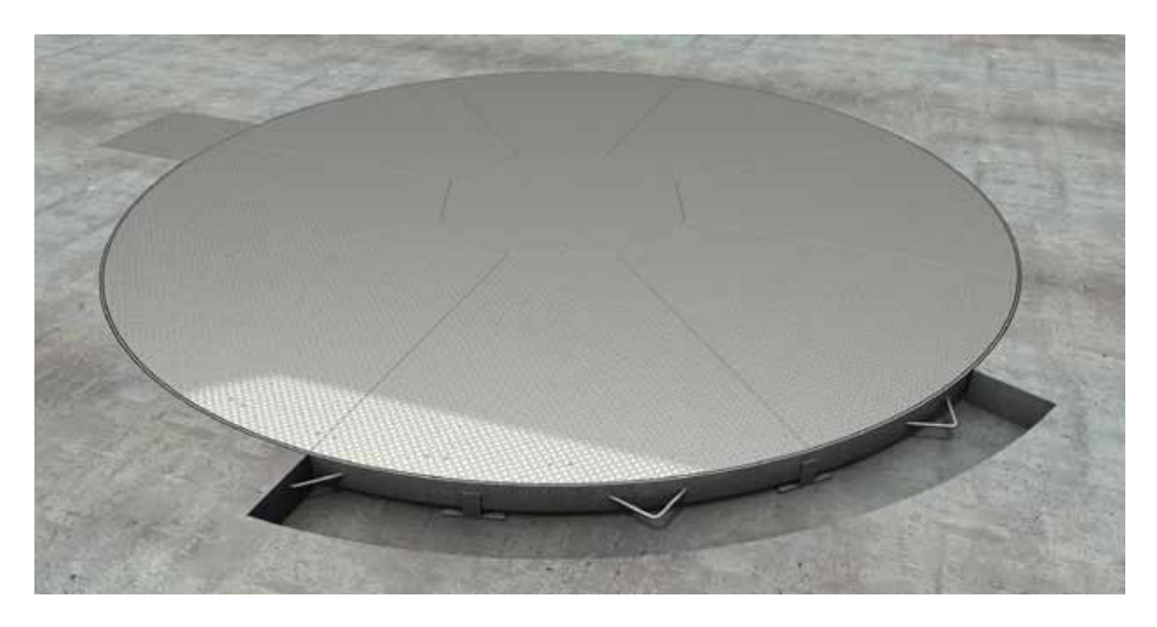
© Copyright Spacepark Global Pty Ltd. Please note that by using this drawing in any format, you accept that Spacepark owns the copyright. You are licensed to use this drawing for any Spacepark turntable on which Spacepark are tendering, and you shall not knowingly allow others to copy this drawing. Obtain appropriate licences from Spacepark if you (or anyone employed or engaged by you) intend to use the intellectual property rights of Spacepark in performing your obligations under any contract. Spacepark reserves the right to amend specifications without notice for product improvement.